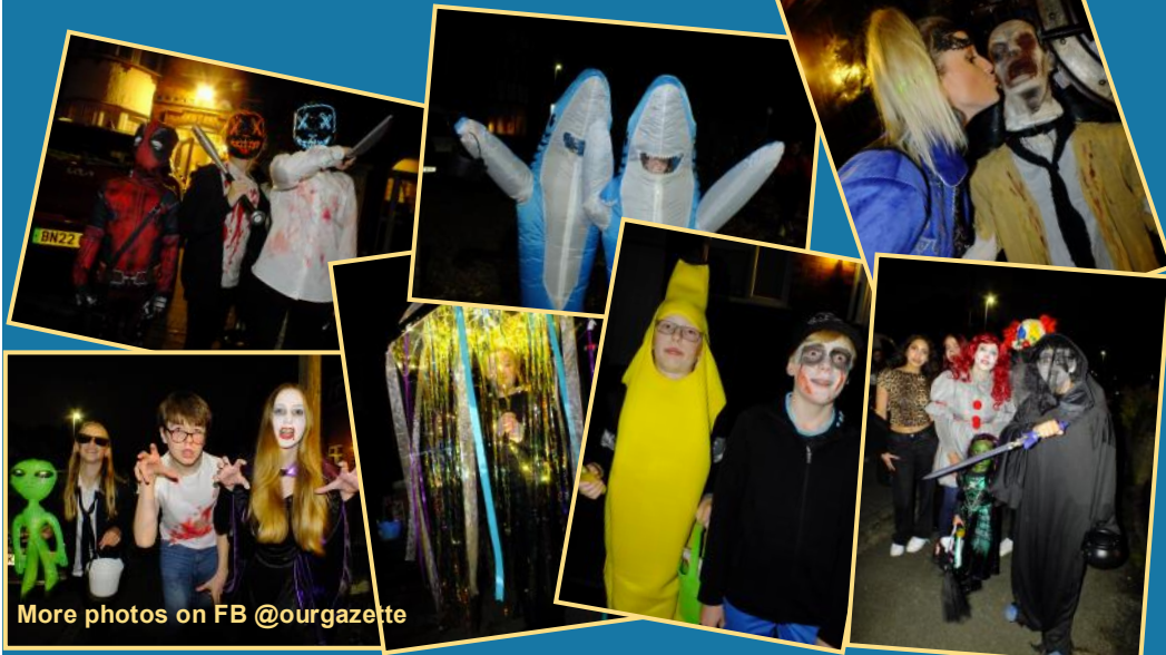
More photos on FB @ourgazette