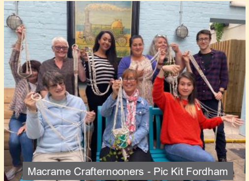
Macrame Crafternoons

Alison Dunne - freelance writer, creative writing workshops & bibliotherapy (Advertorial article)